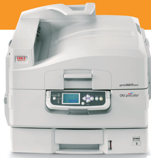
The OKI proColor™ Series pro920WT Color Printer

1-Year On-Site warranty 3 for lower operating costs